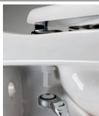
Snap & Secure

5 holes hinge with Sta-Tite® Seat Stability System. Self centering bushing. Bottom fixing. Glass-Filled nylon nut with integrated washers. Nut breaks off at precise tightening torque, resulting in a seat that Stays TITE!