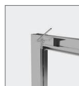
No Drilling Frame