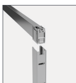
Slot & Lock Mechanism